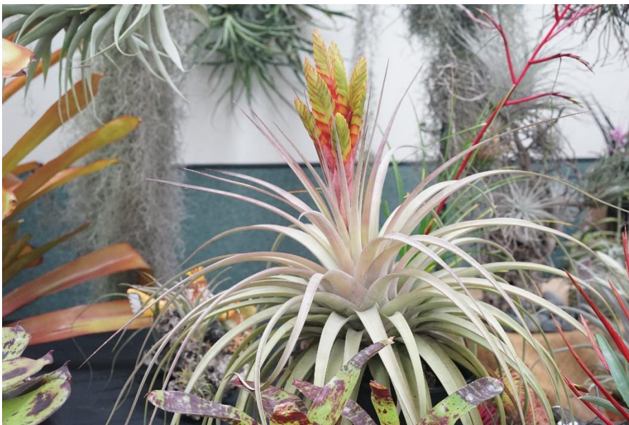
A couple views of the exhibit plus, above, xVrieslandsia Arden's Comet (Vr. simplex x T. australis). Left: Tillandsia 'Silver Queen'

Visit the San Diego Bromeliad Society Facebook page for more pictures and a video of the show.