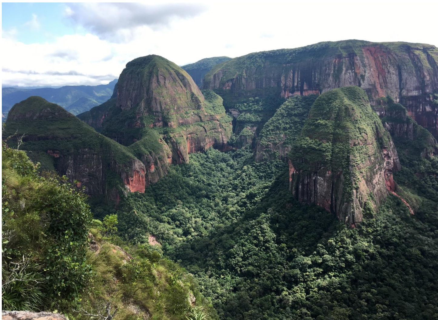
The sandstone cliffs at Amboro National Park, Bolivia